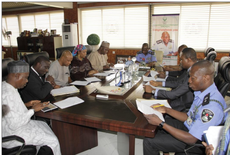
The NAQS delegation with the IGP and his team, during the meeting at Police HQ, Abuja